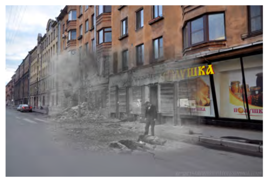
Figure 3 : Leningrad 1941 / St. Petersburg 2012. Victims of shelling in the Glazovskaya Street (now St. Constantina Zaslonova).